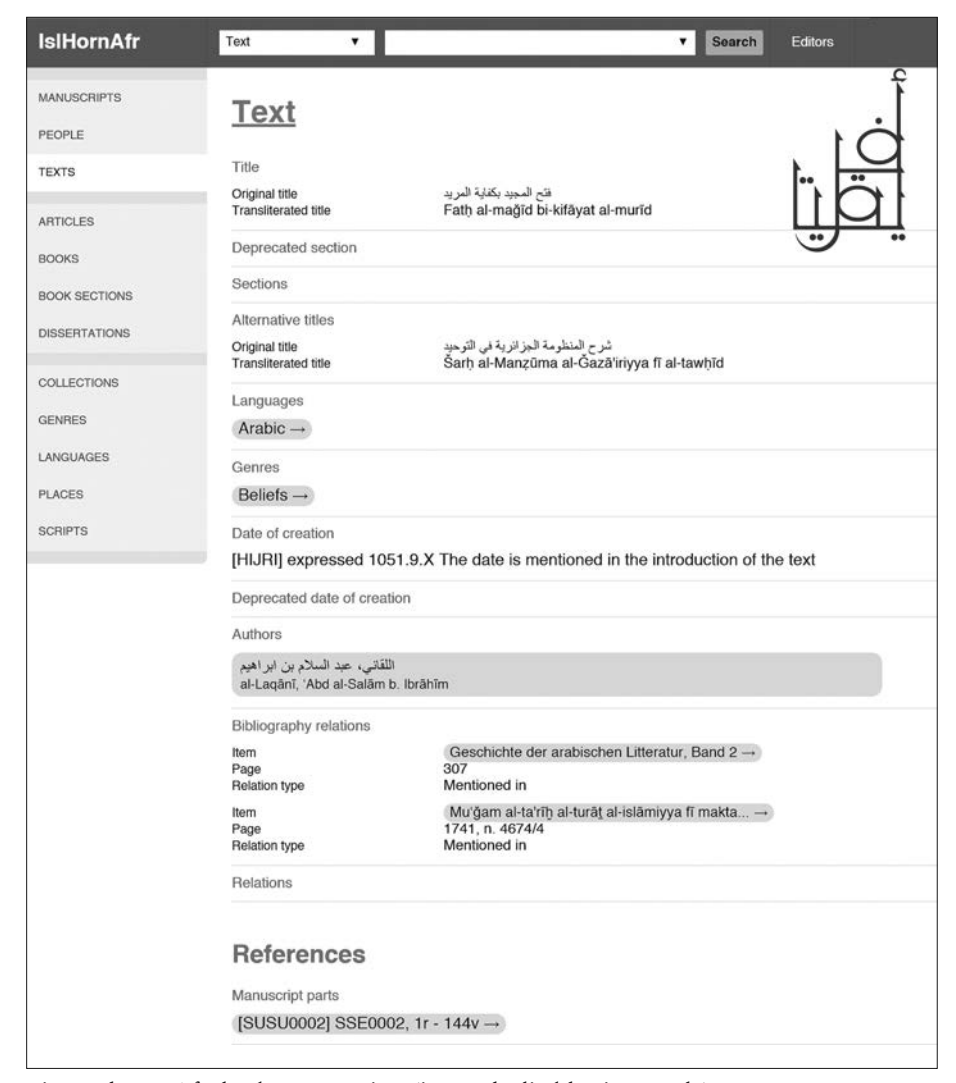
Fig. 1 IslHornAfr database, text view (internal editable view mode).

tion, the project database (see figs. 1, 2) is expected to become an important tool for research in African Islamic literature, African Islamic biography and African Islamic topography.